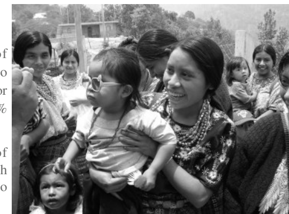
Mother and child in Guatemala