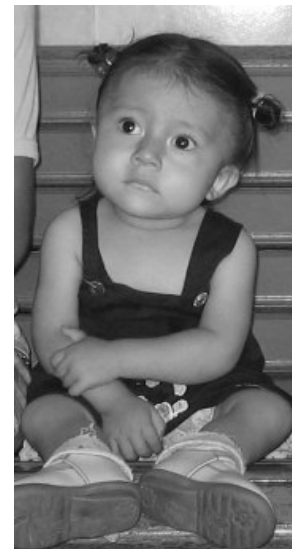
Little girl waiting in clinic in Montero, Bolivia