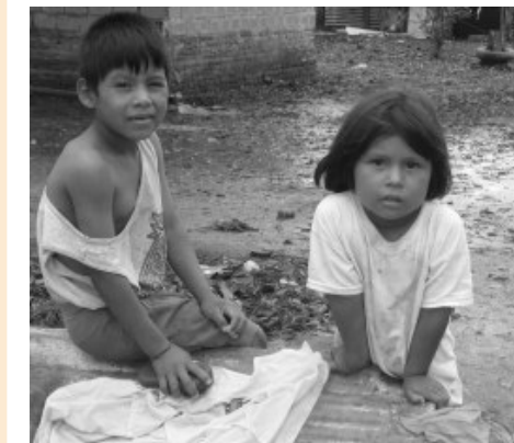
Children in Montero, Bolivia